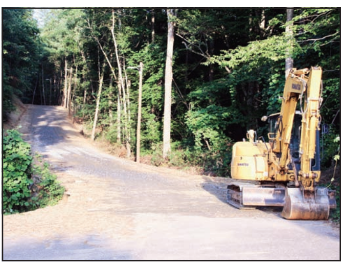
The gravel is down and paving will commence soon on the new Union County Middle School access road behind the Waffle House off Georgia 515.

Middle School riders will enter from the Waffle Housearea access road, head up to the school, and then exit right onto Roscoe Collins Drive toward the