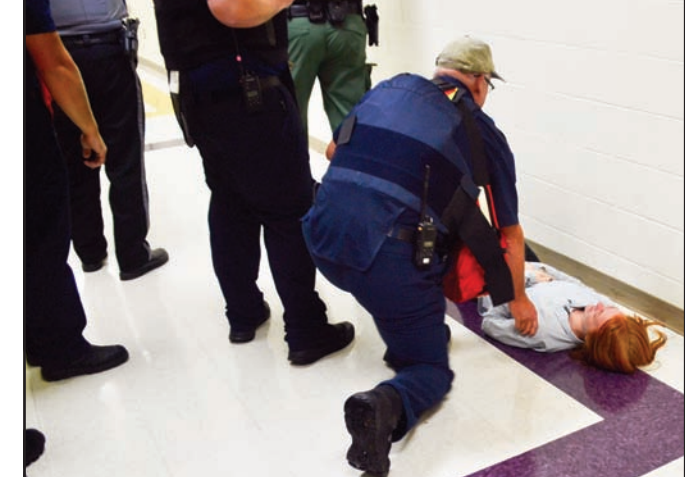
Union County Firefighters took part in the second day of Active Shooter Training on Thursday, July 21.

Participating were the Union County Schools Police, Blairsville Police, Union County Sheriff's Office and Georgia State Patrol, along with the Union County Fire Department Rescue Task Force of paramedics and EMTs and the Union County Emergency Management Agency.